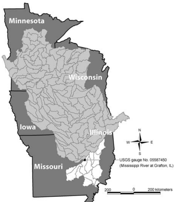
Figure 1. The Upper Mississippi River Basin (UMRB) and delineated subwatersheds. See color version of this figure in the HTML.

quality model. The model was developed to predict the impact of land management practices on water, sediment, and agricultural chemical yields in large complex watersheds with varying soils, land use, and management conditions over long periods of time. It is a physically based model that operates on daily time steps and uses readily available inputs.