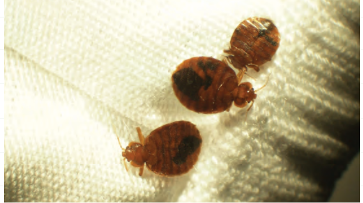
Figure 1. Bed bugs are up to ¼ inch long, broadly oval, flat, and mahogany brown.