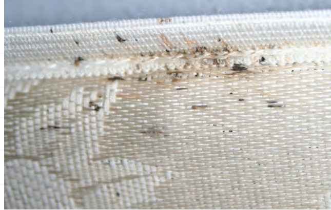
Figure 2. Fecal spots, eggs, and cast skins are common in the cracks and openings where bed bugs hide.