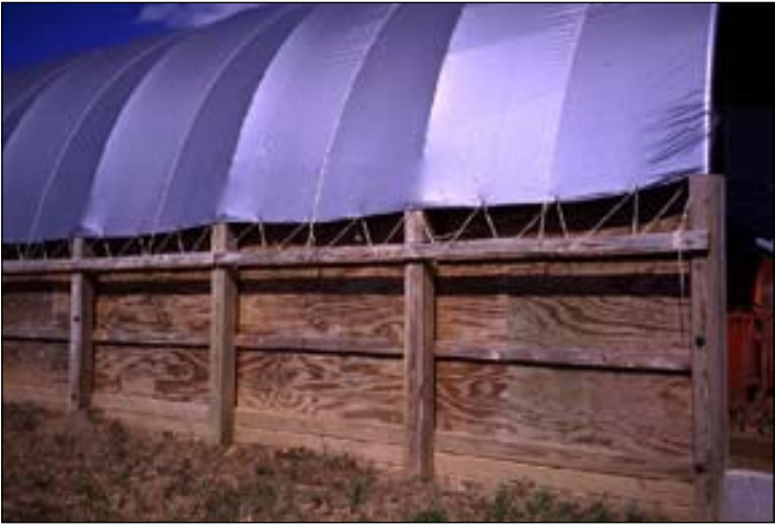
Hoop structures are naturally-ventilated with a polyethylene/PVC fabric roof. Sidewalls are wooden or concrete and are either 4 or 6 ft. tall.

Hoop design represents a union between purpose and functionality. The following images highlight some of the key features that make hoop structures innovative and technologically sound.