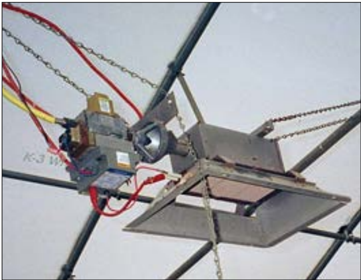
Lighting can be added to the hoop structures if needed.