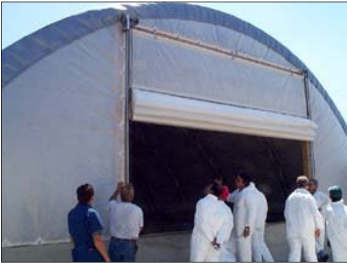
Various ends are available. It is beneficial to be able to close the north end during winter or both ends on occasion. Some fabric ends close much like garage doors...