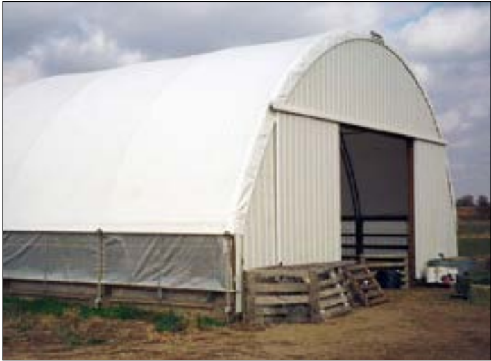
Reflective tarps are used to reflect solar radiation to prevent overheating.