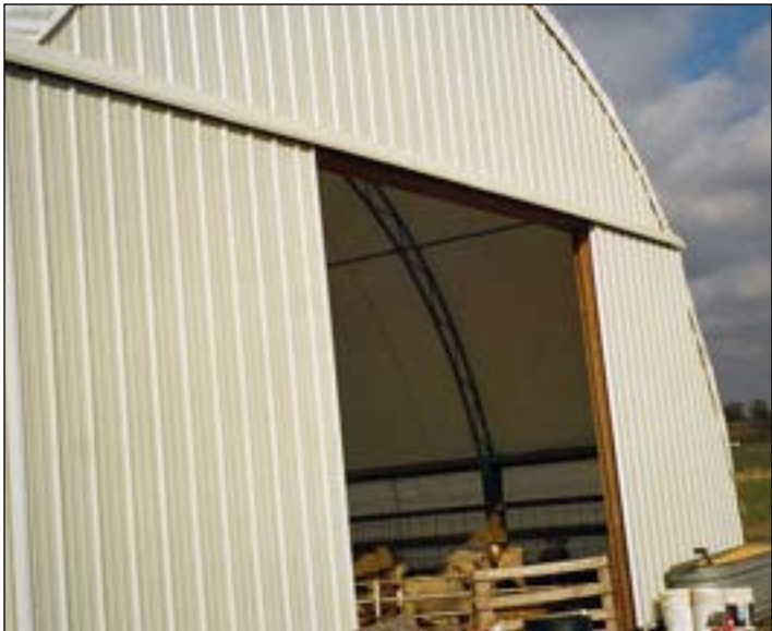
...while others are like barn doors. Care should be taken to not inhibit proper ventilation.