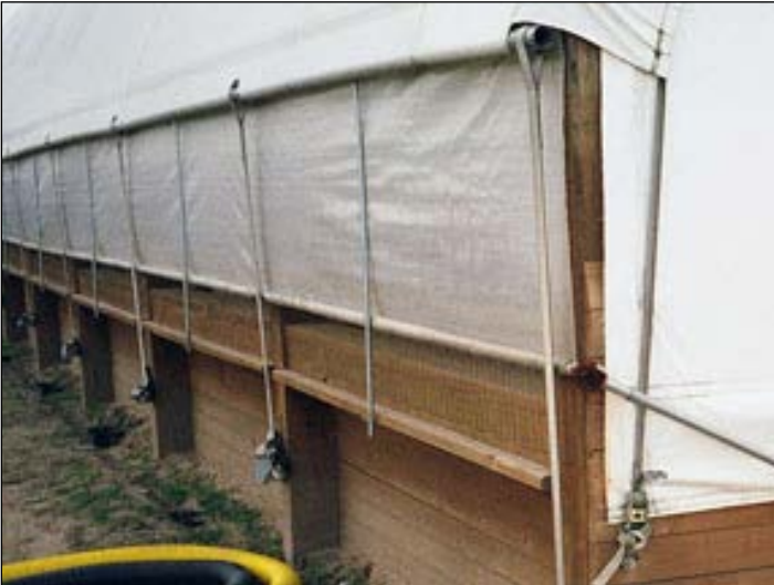
Many hoop structures provide ventilation by leaving the end walls open. Longer hoop buildings add ventilation curtains to the sidewalls that can be adjusted.