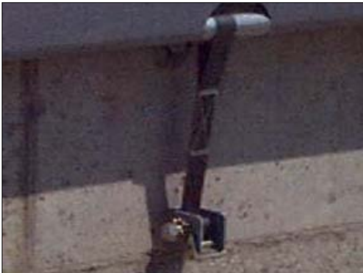
Tarps are held in place by ropes or winches using seat belt-like material.