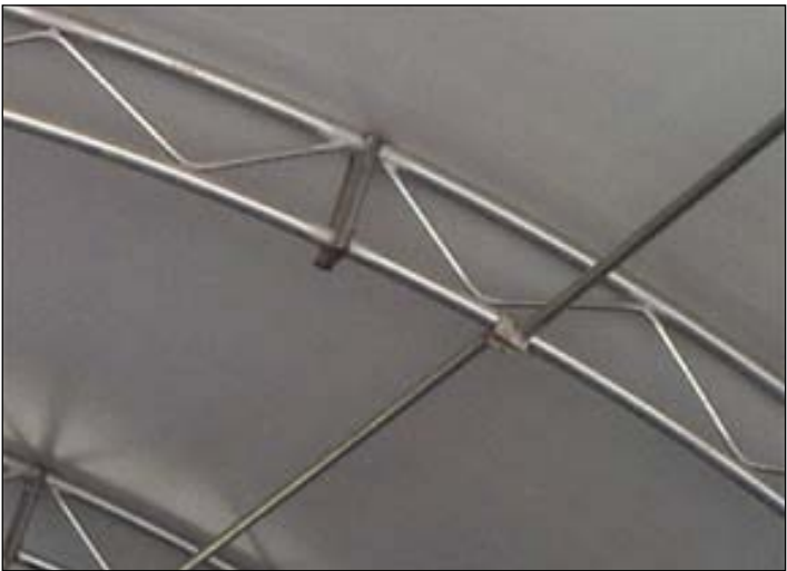
Most hoops use a steel truss system that is engineered to withstand appropriate loads. Narrow hoops sometimes use a simple pipe system for support.