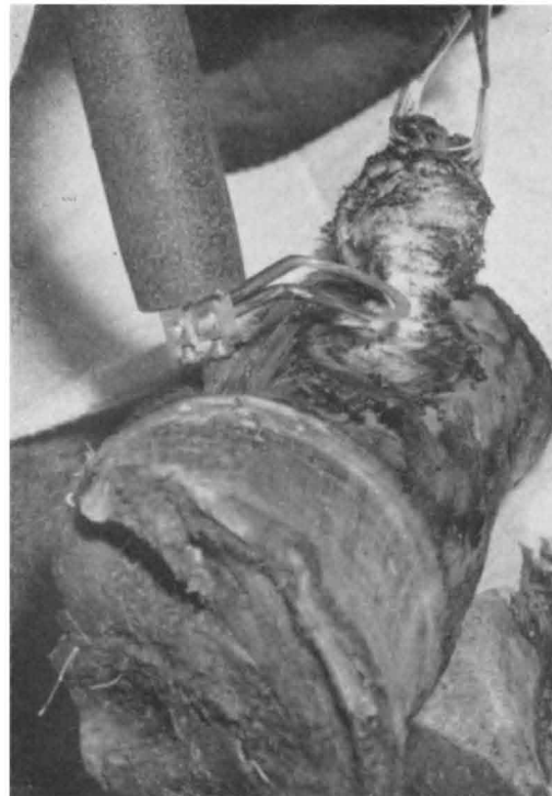
Fig. 4. Removing the Fibroma by Cautery.

Preparatory to removal of the growth, the area around it was shaved and painted with 7 percent tincture of iodine. The area surrounding the lateral digital nerve of the right front leg was infiltrated with 2 percent procaine hydrochloride solution. When anesthesia was complete the tumor was removed by means of the Nicholson firing iron. By this method, more complete control of hemorrhage