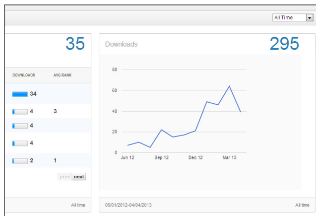
Readership statistics in the Author Dashboard

as technical reports, white papers and student research. These works contain valuable information and complement peer-reviewed publications. Digital Repository @ Iowa State University is an opportunity to share these works with the world.