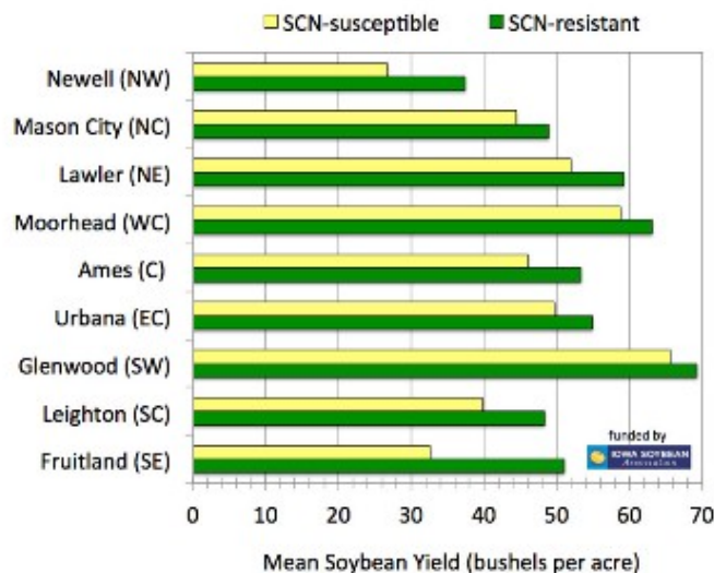
Figure 1. Mean yields of SCN-resistant soybean varieties and widely grown susceptible varieties at nine locations in Iowa in 2013. Data for individual varieties and locations are available at www.isuscntrials.info .

The greatest difference in average yields between SCN-resistant and widely grown susceptible varieties in any variety trial location in 2013 was 18.4 bushels per acre (or 56 percent), which occurred at the experiment conducted in a very sandy field near Fruitland, Iowa (figure 1).