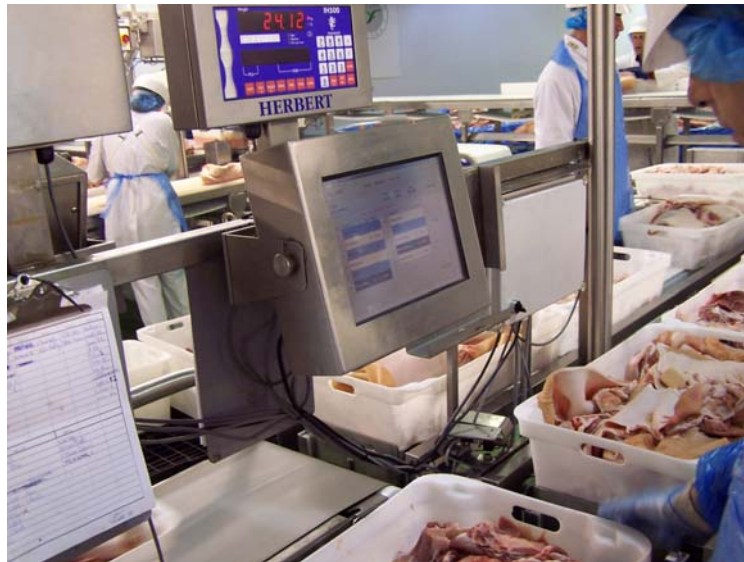
FIGURE 14. Computer monitors instructing meat cutters about how to process each ham

animal is carried through the system or associated with the final product. Discussions with managers at Dalehead reveal that there is interest in tracing select cuts further through the production process; however, there is currently insufficient demand for information about animal characteristics and history to justify the investment in the technology and substantial plant redesign required to enable full trace-back to the individual animal.