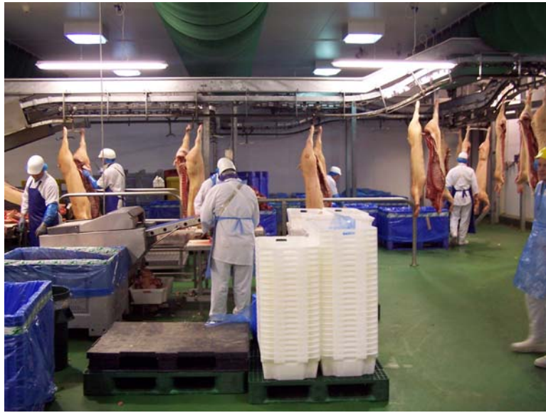
FIGURE 12. Carcass splitting and quartering