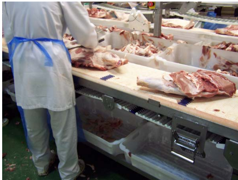
FIGURE 13. Tracking bins with hams and parts