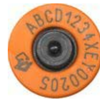
Post Breeder Tag

Leader Products Pty Ltd Unit 4 13 McGowan St POORAKA SA 5095 Australia 08 8262 6722 www.leaderproducts.com.au