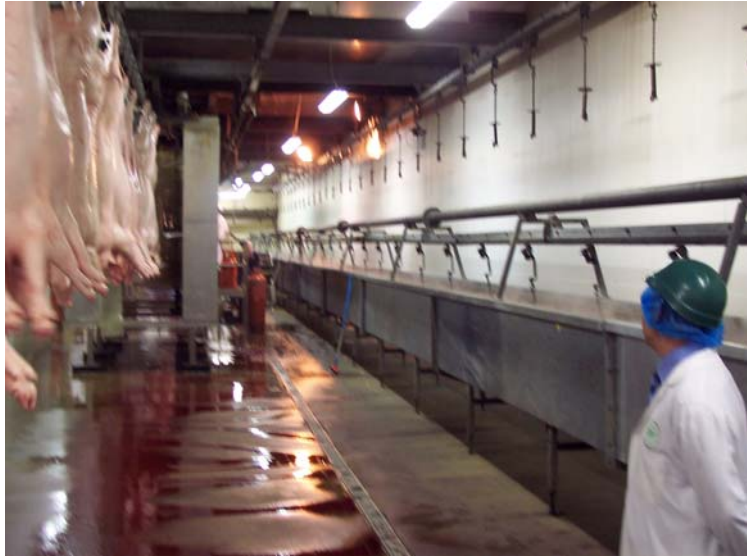
FIGURE 10. Hog carcasses in scalding tanks