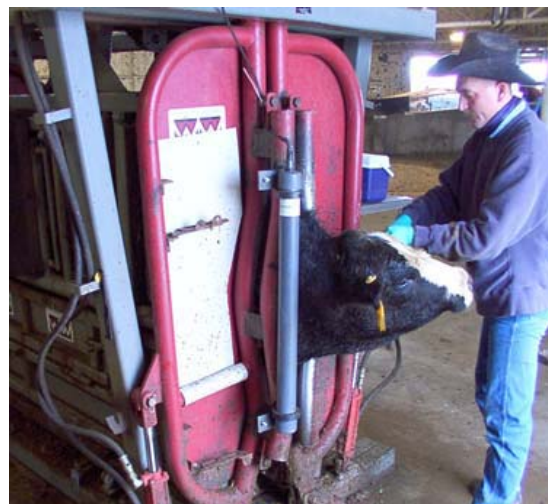
FIGURE 2. Hand scanner, Destron Technologies, Inc.