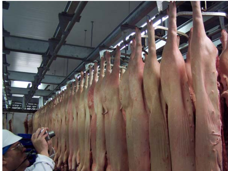
FIGURE 11. Hog carcasses on gambrels in the cooler