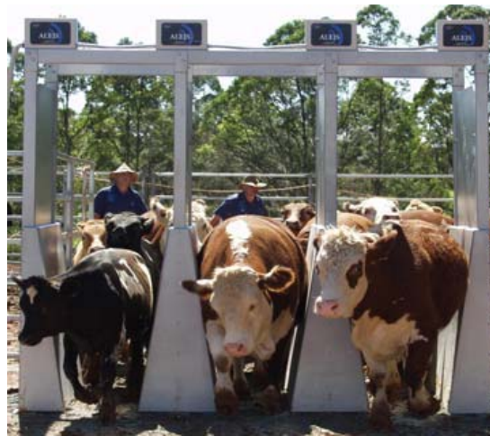
FIGURE 4. Walk-through reader, Destron Technologies, Inc.