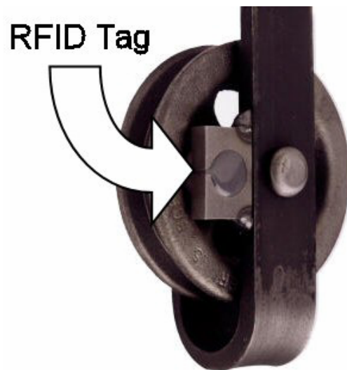
FIGURE 9. Gambrel radio frequency identification assembly

Following the 24-hour (minimum) cooling, the carcass is ready for processing. At this point, identification of individual carcasses is possible since the carcass is still carried by the gambrel containing the RFID chip. After leaving the cooler, the carcass is split and quartered (Figure 12). At this juncture, much of the meat is distributed to cutting stations without further identification or traceability; however, select cuts such as hams are tracked by placing the meat in bins that contain an embedded RFID tag (Figure 13). Information about the product is used to inform meat cutters about how each ham is to be processed during the initial stage of meat processing (Figure 14). The main focus of tracing the carcass to the cutting floor is for quality control, employee accountability, and precision cutting. Once primals are processed, individual pieces of meat are removed from the bins and sorted into aggregate bins by type, grade, and cut. As a result, individual animal traceability stops at the cutting floor and no information about the individual