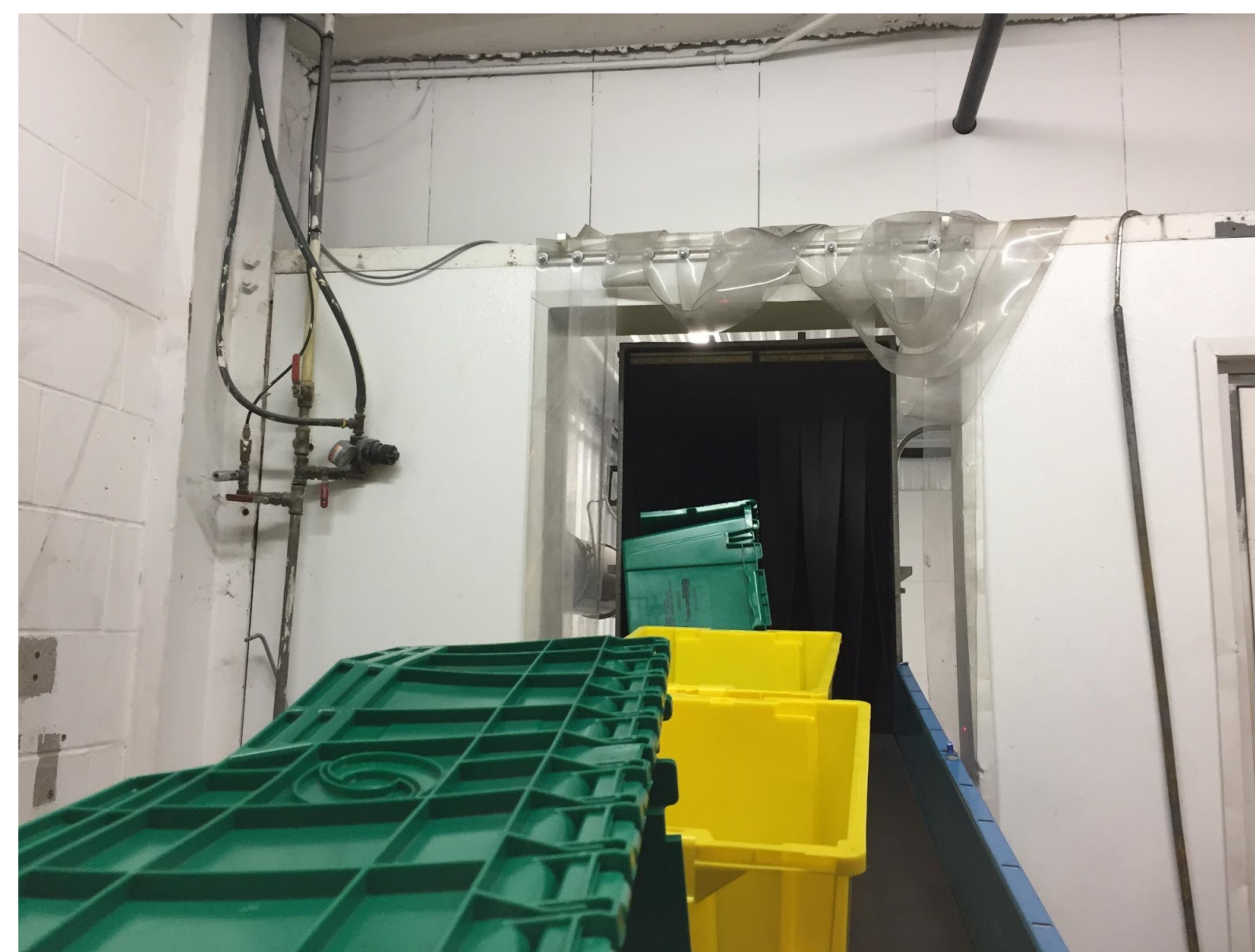
Figure 2: The conveyor leading into the grinder is where the majority of the sound exits.