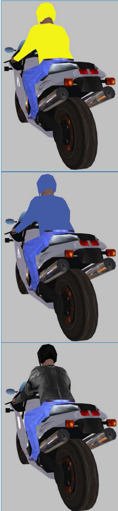
The three combinations for leading parked motorcycles used in the study

The limitations of examining motorcycle conspicuity by analysis of crash data were also discussed. More specifically, potential conspicuity-related factors, such as rider clothing, motorcycle color, helmet color, and motorcycle type, could not be collected from the crash database.