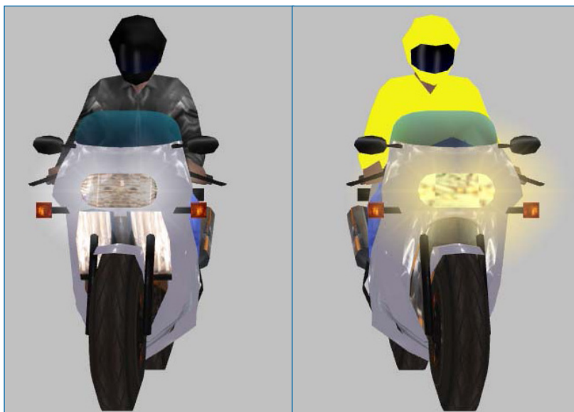
Two of the six oncoming rider and headlight combinations

That project, completed as of September 2010, reviewed previous studies on motorcycle conspicuity with a focus on the effectiveness of proposed measures for enhancing motorcycle conspicuity, and examined the distribution of conspicuity-related factors in light and dark conditions in two-vehicle crashes that could potentially relate to collisions between motorcycles and other vehicles.