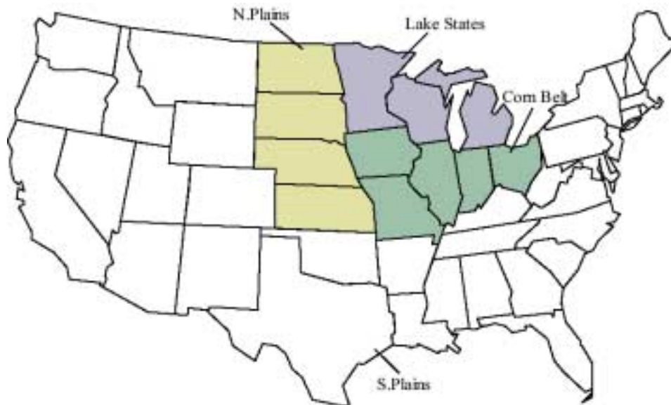
Figure 1. The Study Region.