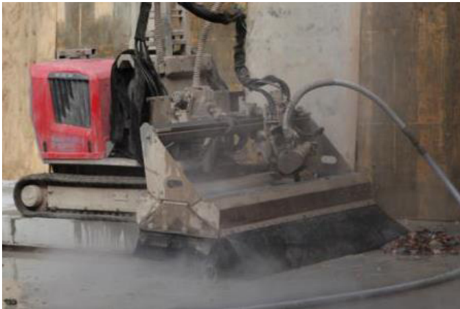
Hydrodemolition trial (Dang 2013)

Small-scale trials of three promising deck removal methods—hydrodemolition, chemical splitting, and peeling—which were identified through the surveys and workshops, were conducted to evaluate their effectiveness.