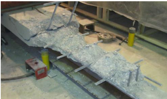
Second peeling test (2 shear studs) (Dahlberg 2014)

These methods have not been widely or often used to remove bridge decks, but were thought to have the potential to change and have a positive impact on the state-of-the-practice for bridge deck removal.