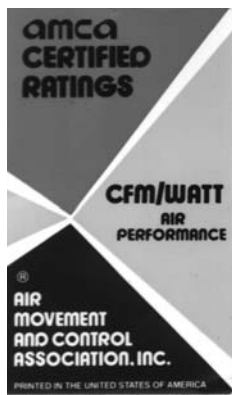
Figure 3. This label indicates that the fan has been tested by the Air Movement and Control Association (AMCA)

tests performed using the fans as they will normally operate, including use of guards, shutters, discharge cones, and other accessories. Beware of using manufacturers' data if it is not backed by an independent laboratory. Two laboratories, the Air Movement and Control Association (AMCA) in Chicago and the Bioenvironmental and Structural Systems (BESS) lab at the University of Illinois, are known to test fans impartially. AMCA has been the industry standard for many years. Fans that have been tested by AMCA will carry a decal similar to the one in figure 3.