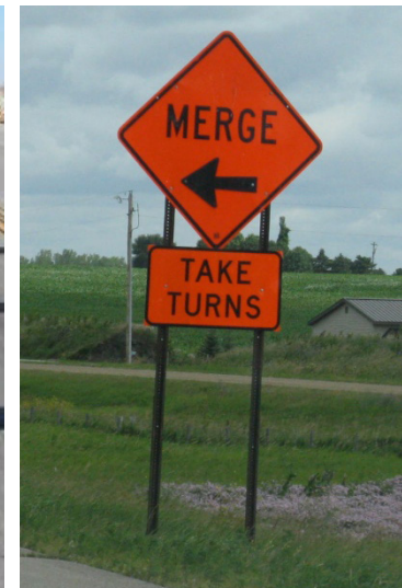
Late merge signs top and bottom right, variable speed limit equipment middle left, dynamic merge equipment middle right, and temporary rumble strips bottom left