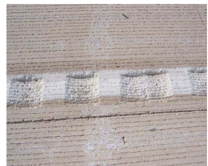
Similar wear for edge line in rumble stripe and flat section