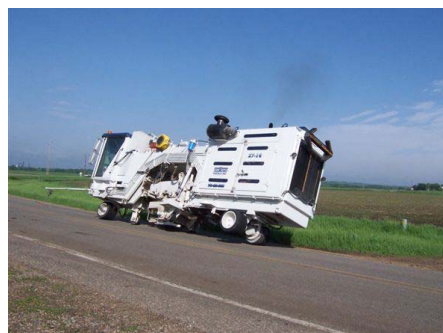
Milling machine tipping on low side of elevated horizontal curve