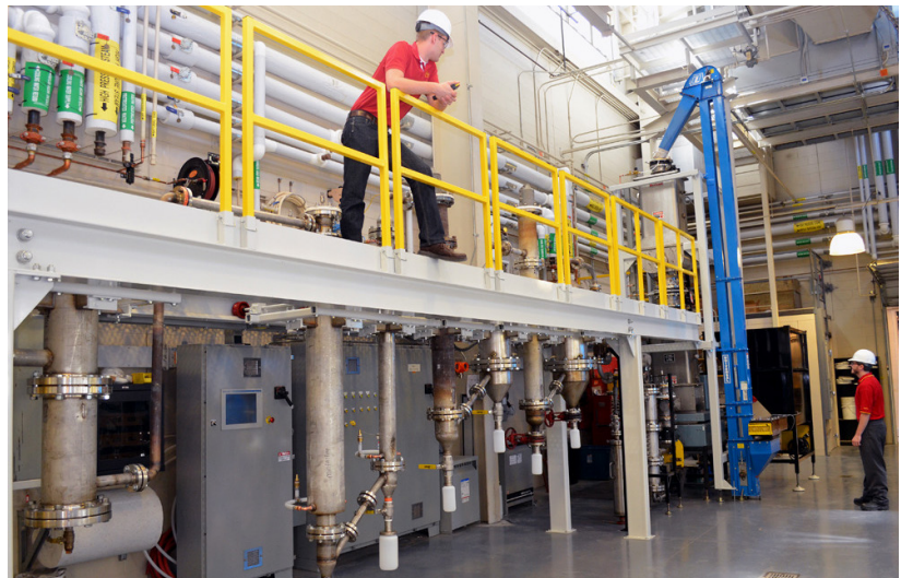
Iowa State University biofuels fast pyrolysis pilot plant

While the rheological properties of neat bio-binders differed from those of conventional asphalt binders, polymer modification of the bio-binders significantly changed their rheological properties and made their rheological behavior similar to that of conventional asphalt binders. Good high-temperature performance grades were obtained for the bio-binders, which performed similarly to conventional binders. However, low-temperature performance grades varied greatly from those of conventional binders.