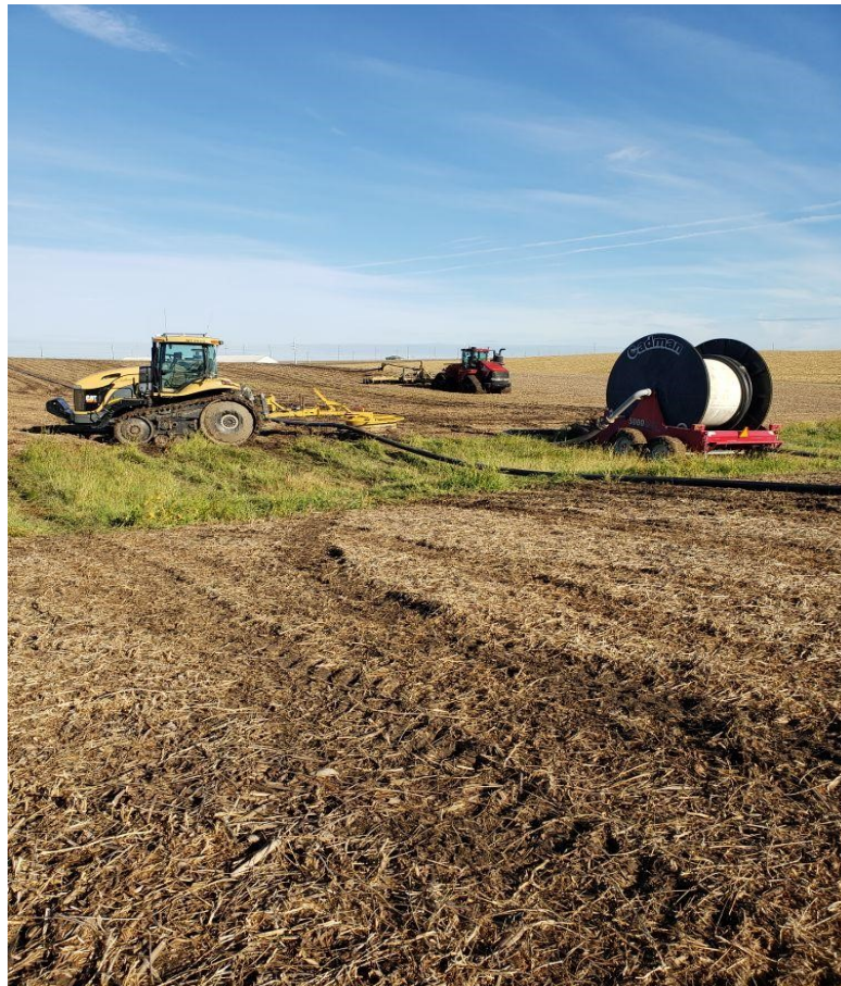
The hydraulics on the Cadman reel were modified to give more hydraulic flow to the motors.