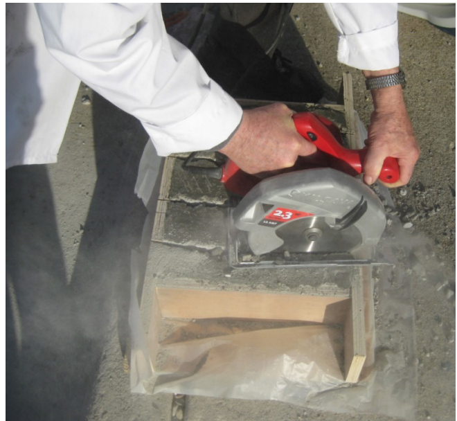
Saw cutting a test slab using poor practices