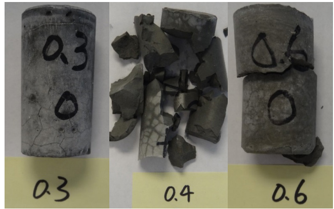
Oven-dried paste samples with different w/cm ratios after one freeze-thaw cycle

Paste samples were cured in sealed containers for 24 hours after mixing while being continually rotated. Samples were kept in sealed bottles for 7 days at 75°F before a cyclic freeze-thaw test. The lids were then removed, and the oven-dried samples were kept in an oven at 122°F until constant mass was achieved.