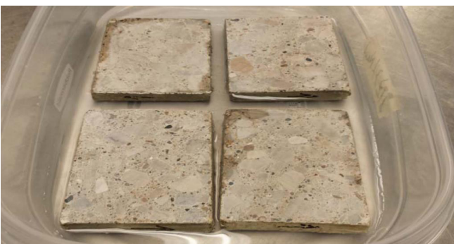
Samples partially immersed in testing solution

This test examined the parallels between paste porosity and nondurable coarse aggregates using cement pastes with different water-cement (w/cm) ratios, supplementary cementitious materials (SCMs), and drying treatments.