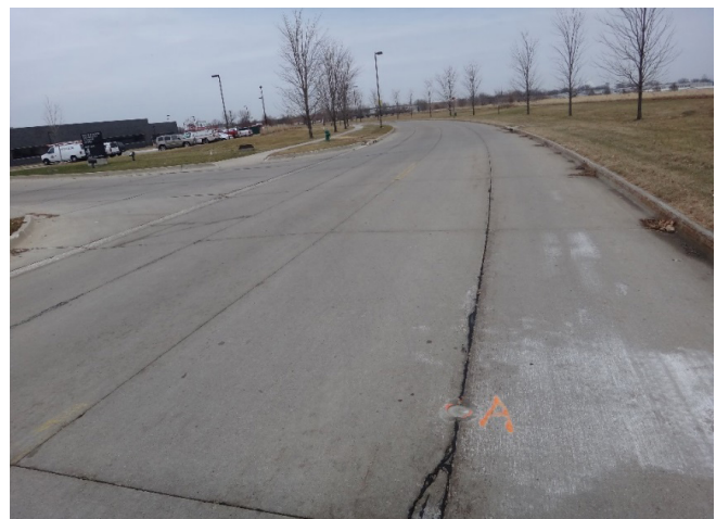
Joint distress on a city street in Ames, Iowa

This test examined the relationship between pavement performance and the permeability of subsurface layers. Field tests were conducted on a city street in Ames, Iowa, which had been paved in 1997 in one day using a full-width slipform paver. Joint sealing details and the extent of the pavement's distress were mapped.