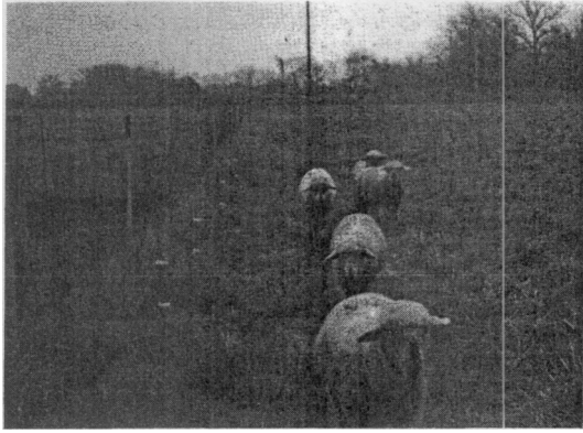
Sheep pictured were part of DE-feeding trials conducted at ISU's McNay Research Farm.