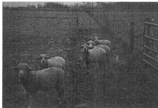
White-faced cross-bred lambs typical of a commercial flock were used in the DE project.