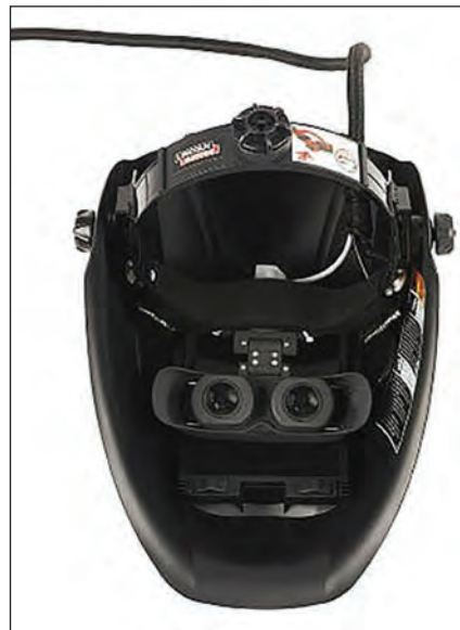
Fig. 3 — A VRTEX® 360 welding helmet with 3D goggles.

Within a task performance, the researchers focused specifically on the effect of an individual's cognitive ability for task knowledge and task skill when completing welding-related tasks.