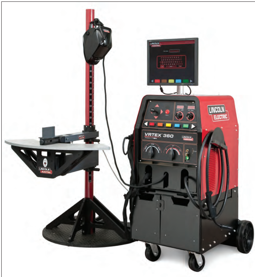
Fig. 1 — A VRTEX® 360 welding simulator.

but depended on the level of task difficulty (Ref. 12). However, the ability of VR simulations to evaluate existing skill has received only limited attention.