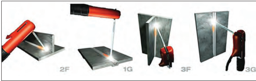
Fig. 2 — Welds completed by participants.

that look and feel like actual procedures help clinicians develop skills and maintain those skills throughout their professional practice (Ref. 19).