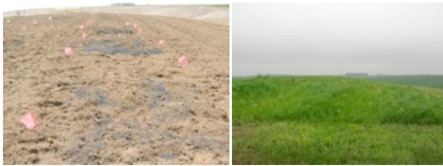
Figure 1. Experimental biochar plots, April (left) and August (right) 2011, Western Research Farm.