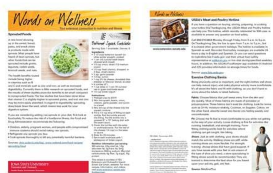
Table 1. WOW Newsletter Sections