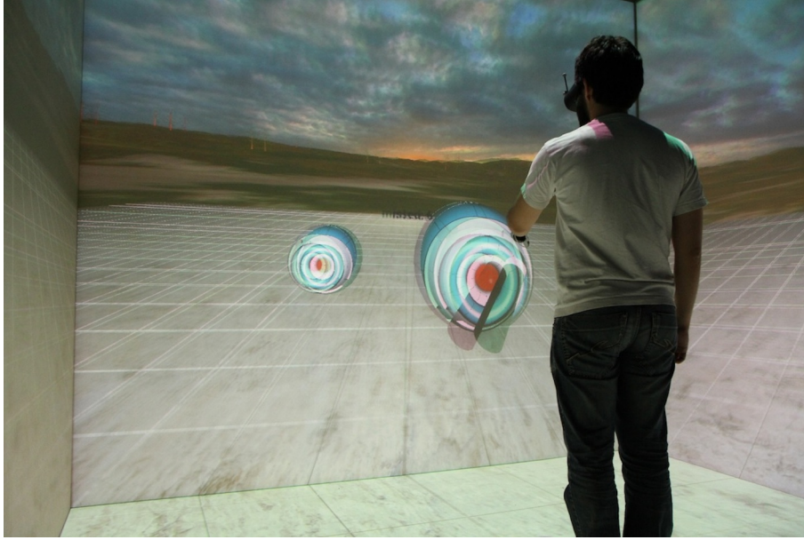
Fig. 1. Experimental setup with an array two spheres