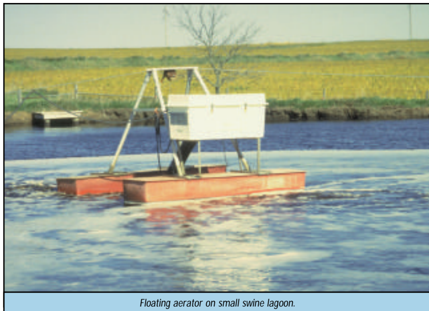
Floating aerator on small swine lagoon.

In aerobic systems the resulting gaseous products are carbon dioxide, water, and sulfates, rather than methane, hydrogen sulfide, ammonia, and volatile acids. The products of properly designed and operated aerobic systems are not odorous.