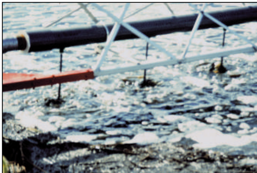
One cooperator with the Odor Control Demonstration Project is using a complete aeration system in a large (3,400 sow farrow-to-wean) swine operation.