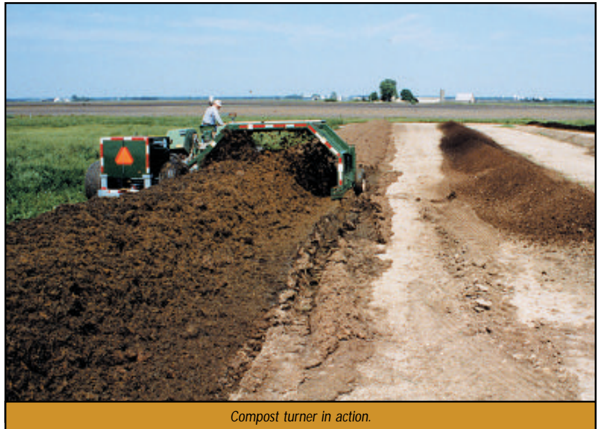
Compost turner in action.

Costs will rise further if composting is done in dedicated buildings. Based on costs approved for the Odor Control Demonstration Project composting costs using tractors and loaders range from 20 cents to 40 cents per head of swine marketed.