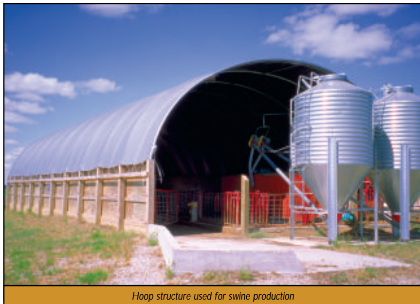
Hoop structure used for swine production

Evaluations at Odor Control Demonstration Project sites show well managed composting to be essentially odor-free. Windrows with forced aeration and turned piles each yielded favorable results. The key to effective composting is providing adequate oxygen through good management.