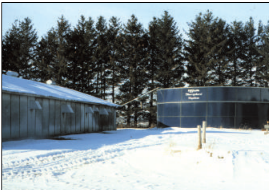
Row of mature evergreens protecting swine building and steel manure tank.