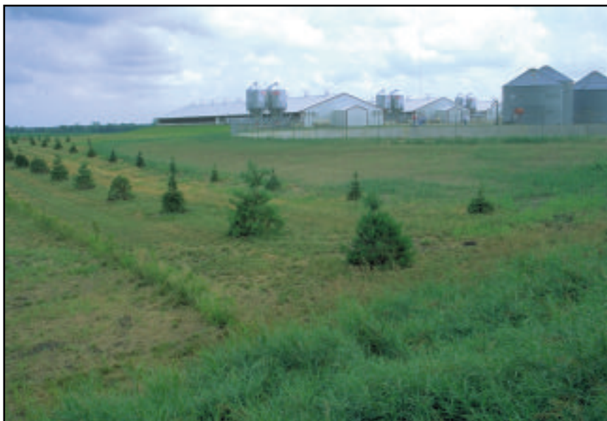
Evergreens and shrubs near an outdoor concrete pit.

Most landscaping treatments for the odor control demonstration project include some fast-growing trees such as Austrees, as well as some slower-growing, more permanent trees such as evergreens or hardwoods.