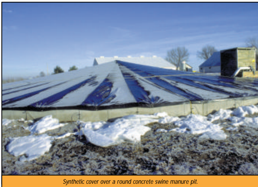
Synthetic cover over a round concrete swine manure pit.

Synthetic covers on top of liquid storage units provide a physical barrier between liquid manure and the air. They work well when properly installed. To be effective at reducing odors, the covers must be attached to prevent the wind from catching and whipping them, and they must cover as much of the storage structure as possible. Floating covers are most popular, although one of the demonstration sites used a cover supported by cables above the stored liquid. Three cooperators are demonstrating synthetic covers in the Odor Control Demonstration Project.