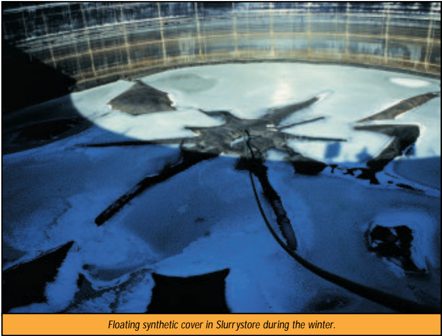
Floating synthetic cover in Slurrystore during the winter.