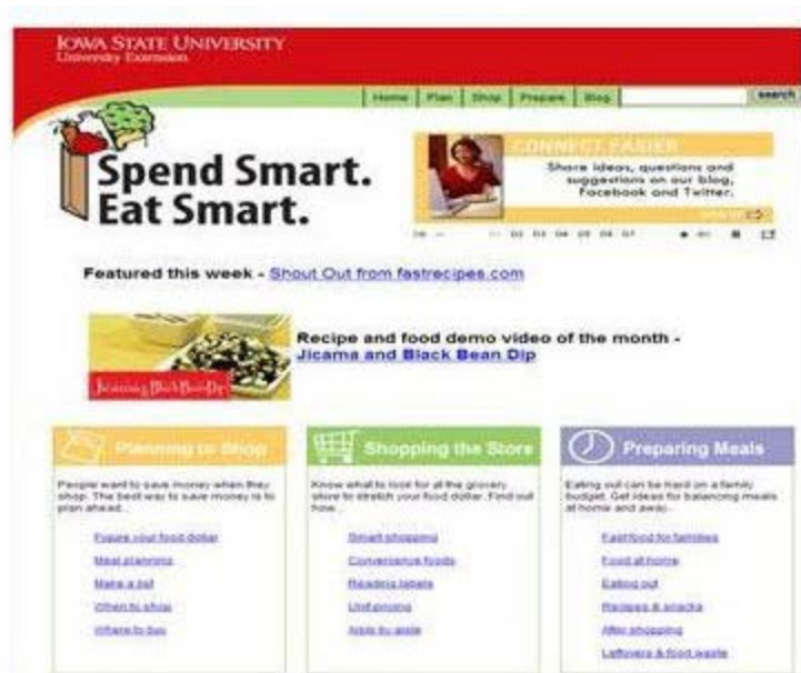
Figure 1b. Revised SSES Homepage