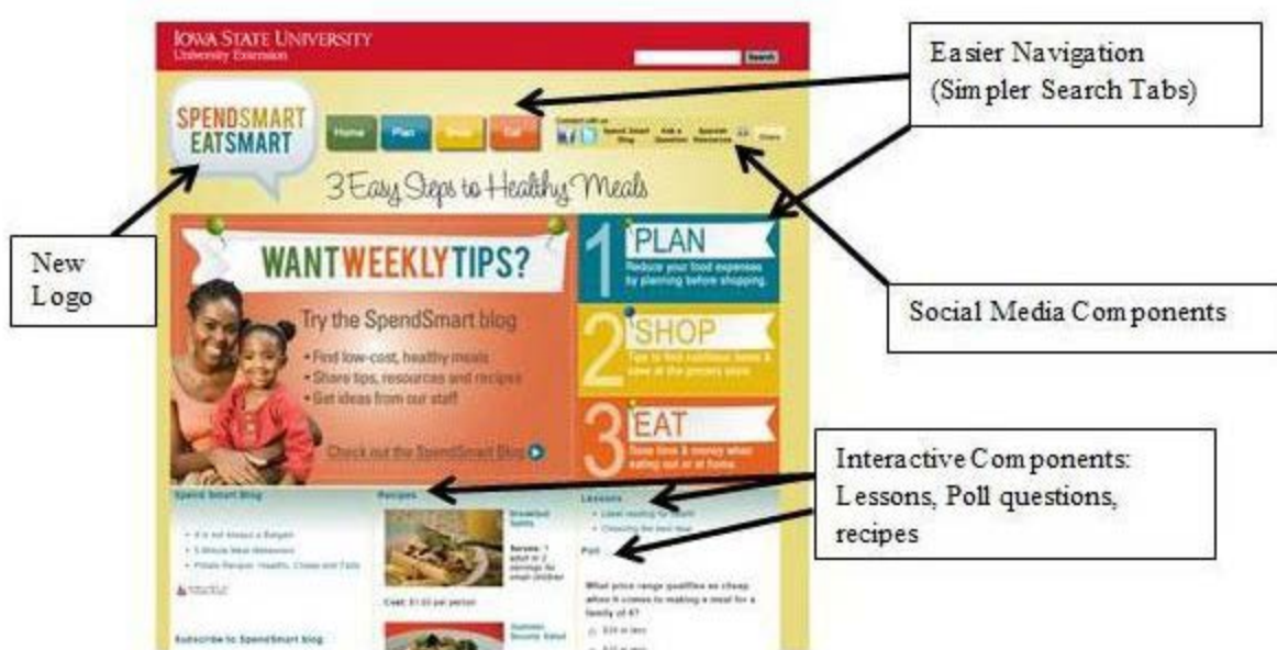
Figure 1c. Original SSES Content Page