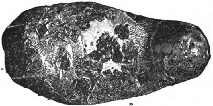
FIG. 3 - Potato scab.