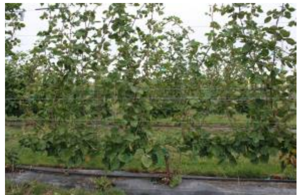
Figure 2. Photographs of rotating cross-arm trellis systems used in thornless blackberry research plots at the Armstrong Memorial Research and Demonstration Farm, Lewis, IA, 2013.