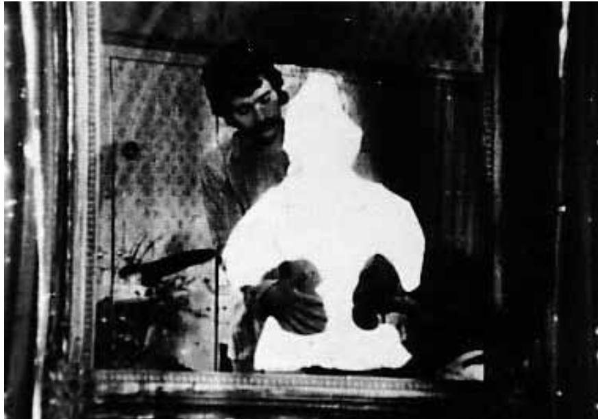
Naomi Uman, removed (1999), frame enlargement.

can be appreciated as a metacinematic masterpiece, a film that foregrounds its own construction—and destruction. (It's hard to watch removed without thinking about the laborious work involved in erasing the women from each and every frame of the filmstrip using nail polish remover and bleach.) And it can be understood as a sophisticated feminist film, one that subverts the male gaze and undermines the goals of traditional pornography. Since the sexy women have been erased, one instead notices elements that might have otherwise gone undetected: a small cup of coffee, some Deutsche marks lying on the bed, a steely-eyed stud's formidable sideburns.