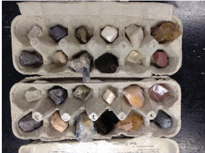
FIGURE 3: Mineral samples from sets A and B.

(Fig. 3). There are two sets of mineral samples (A and B) that each contain the same 12 minerals, but the forms of some of the minerals differ between the sets (e.g., set A has specular hematite and set B has oolitic hematite, set A has calcite showing its cleavage and set B has calcite showing its crystal form, set A has milky quartz and set B has rose quartz). After working with their set, groups switch sets with another group and test how their classification scheme works with the new samples. The differing forms of minerals between the sets cause problems in students’ self-created schemes. The paired groups compare their results and classification schemes, discussing where and why any discrepancy arose. This is followed by a whole class discussion on the problems that students encountered, followed by a brief overview of the physical characteristics (e.g., luster, hardness, streak) geologists use to identify minerals and the commonly accepted classification scheme. This allows students to see the rationale behind the accepted classification scheme instead of just memorizing it. Finally, they use what they learned about how minerals are classified, and identify 15 new mineral samples.