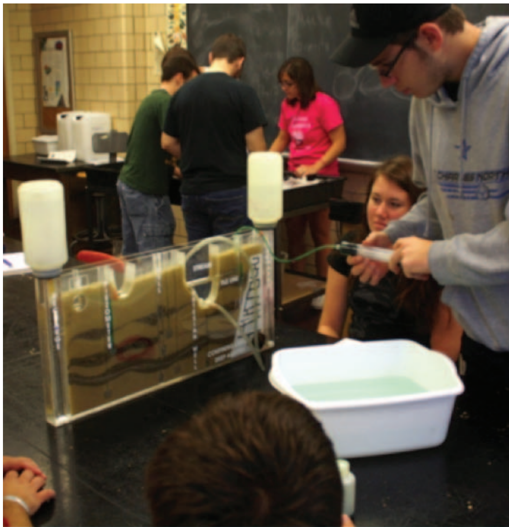
FIGURE 2: Students using the ant farm groundwater model. In the background, students working around the stream table.

projects are rudimentary and basic, but provide scaffolding for their semester-long research project.