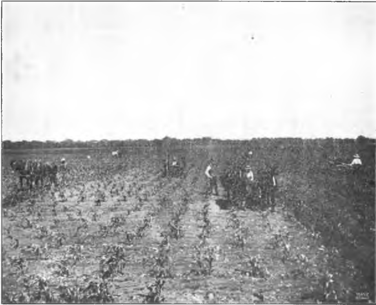
Cultivating Corn on College Farm.

and removing to the greatest possible extent any source of error in the weights. Seven thousand pounds of corn were husked and stored in the crib Oct. 19, 1898. The crib is 13\frac{1}{2} feet long by 7\frac{1}{2} feet wide, thus making the conditions normal for corn storage. After storing, the corn was weighed once a week for a year. These weights show some variations due to weather conditions, which in all probability affected the crib more than the corn, but in periods of three months this variation is so slight that the following data may be considered the normal shrinkage of the corn: