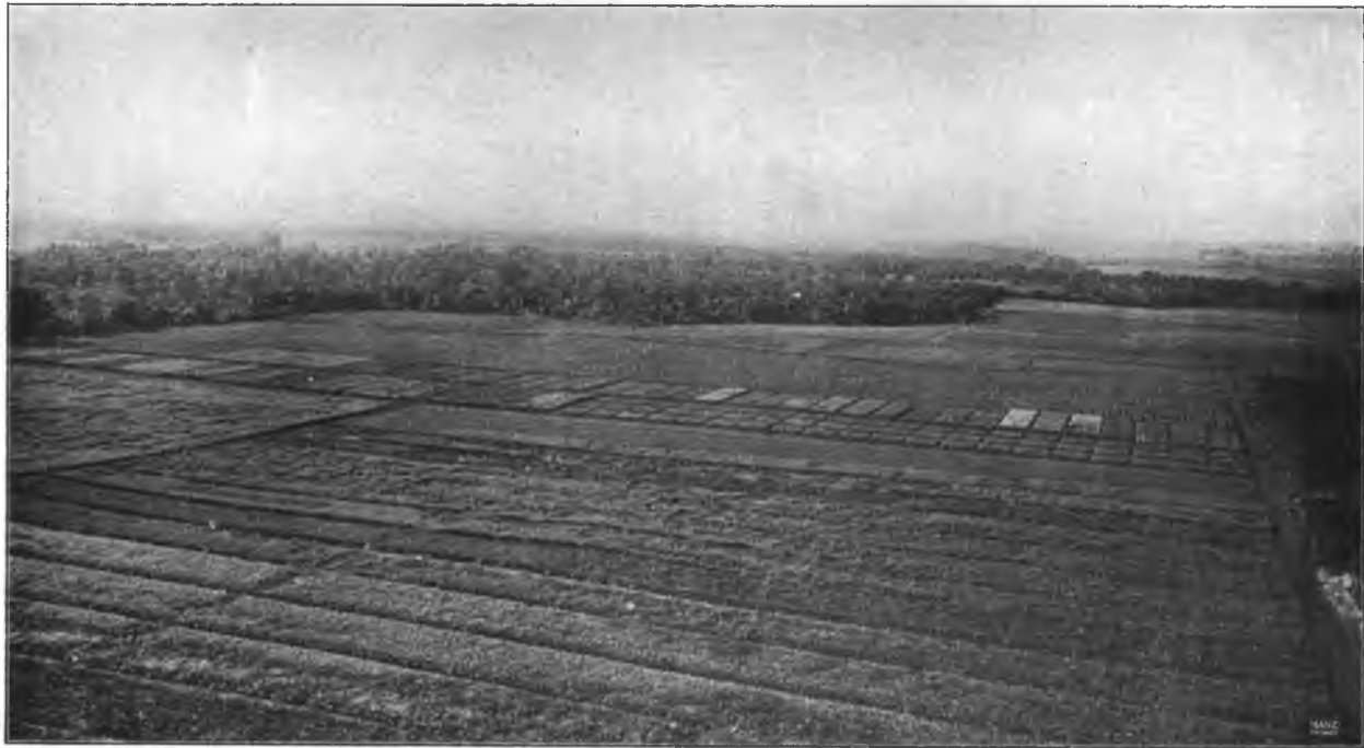
Experimental Grounds Looking Northwest from Water Tower.