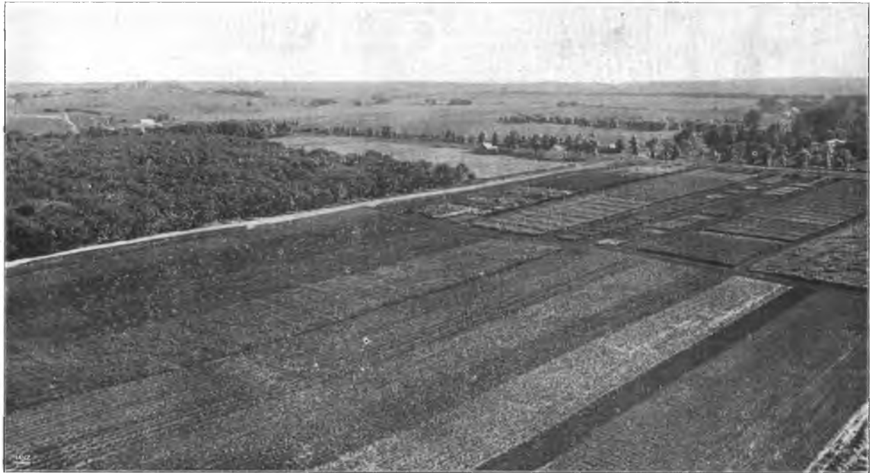
Experimental Grounds Looking Southwest from Water Tower.