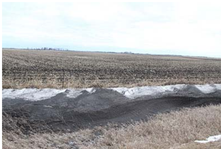
Photo 1. Wind erosion sediments; sediment-covered snow by a tilled field.

Wind erosion occurs in Iowa even during winter. Its effect is especially noticeable when the snow is covered with black sediments from the erosive force of wind, even at subzero temperatures (Photo 1 and 2). Water erosion is also a major concern. Erosion caused by water far exceeds the amount of sediment loss by wind because of the high volume of precipitation, and its powerful erosive effects on removing sediments and associated organic matter and nutrients to water ways. However, wind erosion contributes to the significant loss of top soil, especially the loss of organic matter at the soil surface.