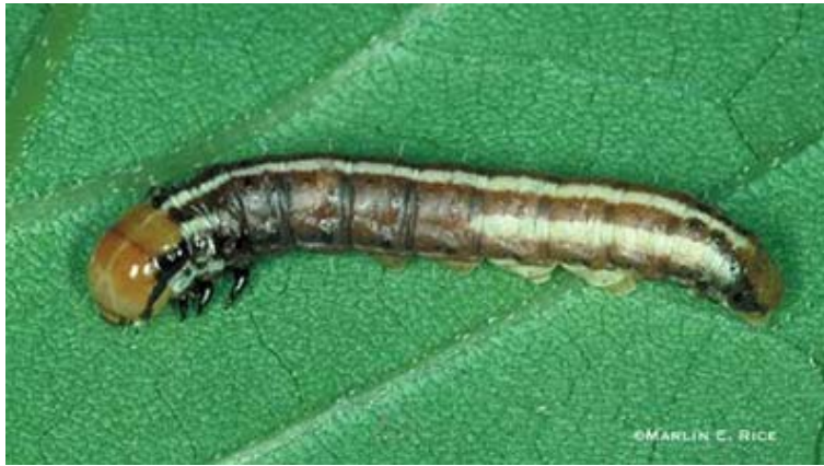
Photo 1. Common stalk borer larva.