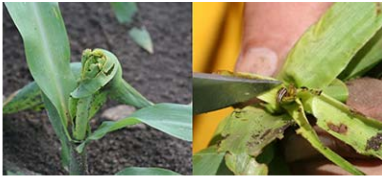
Photo 3. Stalk borer larvae can shred corn leaves and destroy the growing point.