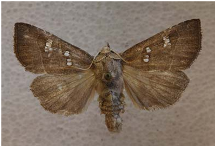
Photo 2. Common stalk borer adult.