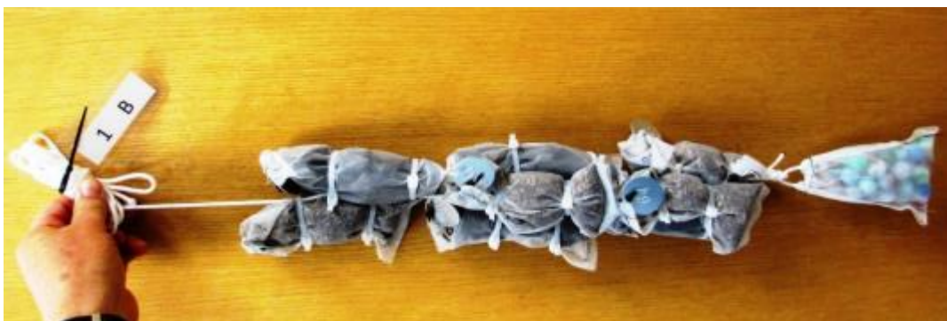
Figure 2. Wood chip sampling bag assembly image.