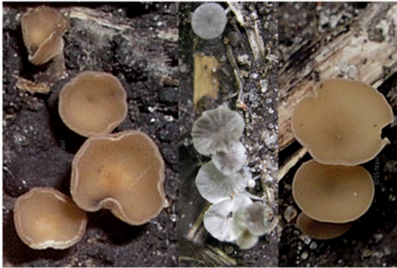
White mold mushrooms (left and right) and other mushroom (center white).