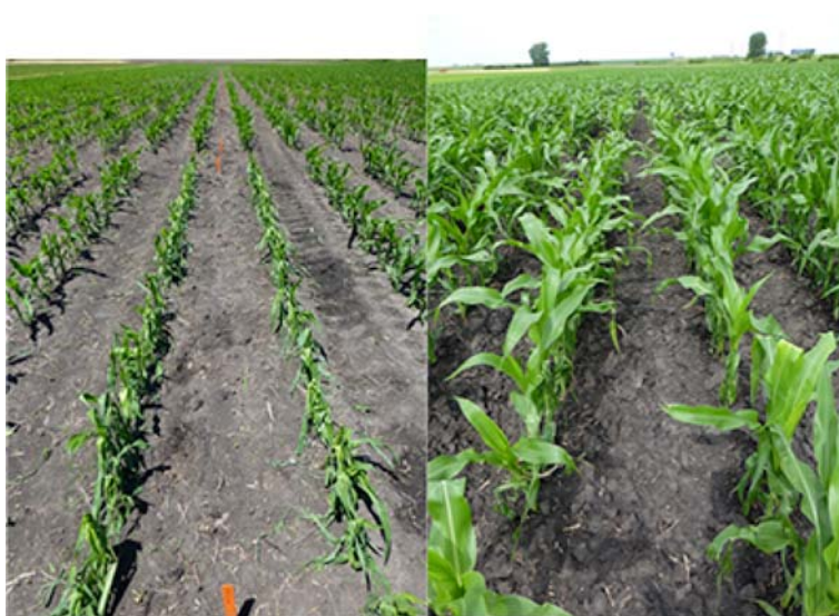
Figure 2. Corn plots immediately after simulated hail (left) and nine days later (right) from hail trials this spring.

We are now studying management of crops after hail events during early vegetative growth or during grain fill. Some of the more severe hail events the past few years have occurred earlier in the season. We have already applied “hail storms” to V5/V6 corn at research farms in Kanawha, Iowa, and Ames, Iowa, in 2015, with fungicide applications following at 7-10 days afterward (Figure 2).