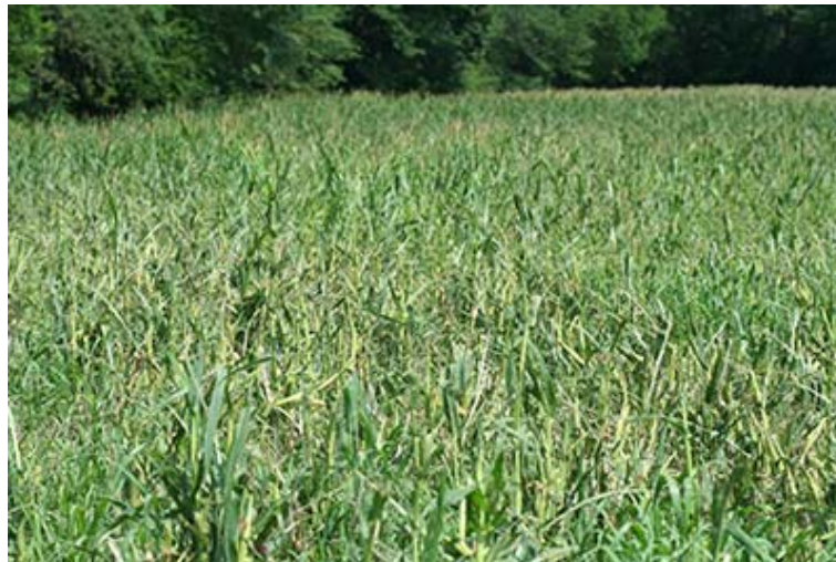
Figure 1. Battered corn plants after a hail storm.

Hail annually destroys approximately 1.4 percent of corn (Climate of Iowa 2006). Years like 2009 stand out vividly to many people as major hailstorms cut across parts of Iowa, damaging more than 1 million acres of corn in a single season. Many farmers and agronomists have been interested in the effects of fungicide application on corn after a hail event (Figure 1). In response, a multi-year study looking at mid-season "hail events" with fungicides applied after simulated hail events was completed. Here is a video of the project.