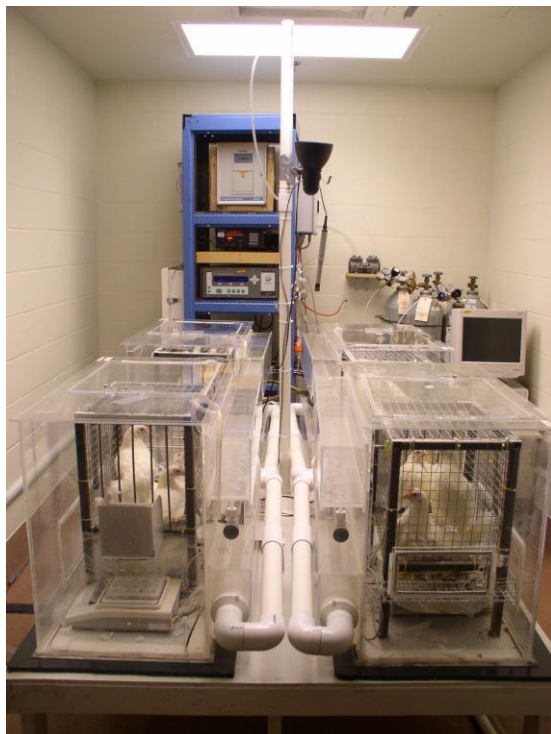
Figure 1. ISU multi-chamber dynamic air emissions measurement system.

To complete the randomization process and avoid chamber effect on measurements, groups of birds under the same SD regimen switched chambers on a weekly basis, so that by the end of the trial, all SDs would have been run in all four chambers at each age.