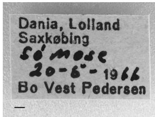
Fig. 2. Locality label of the proposed neotype of Tipula contaminata . Scale bar 1mm.

in Fabricius's works. Meigen's generic description (diagnosis based on the elongate first antennal flagellomere/third antennal segment) does not fit the holotype of Tipula contaminata Linnaeus, 1758. Specifically, 'PTYCHOPTERA. Die Fühlhörner vorgestreckt, sechszehngliedrig: das erste Glied walzenförmig, kurz; das zweite becherförmig; das dritte walzenförmig, lang; die folgenden länglicht, dünnhaarig Die Flügel halb offen.' [PTYCHOPTERA. Antennae stretched forward, sixteen segmented: the first segment cylindrical, short; the second cup-shaped; the third cylindrical, long; the following oblong, fine setae. The wings half open.] In the Linnaean type specimen the first flagellomere/third antennal segment is round, and not significantly longer than the succeeding flagellomeres.