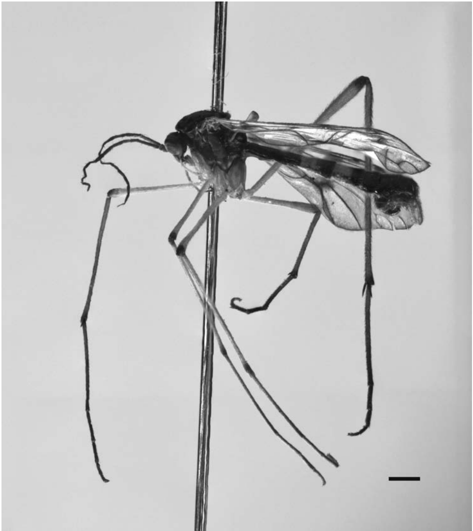
Fig. 1. Habitus of the proposed neotype of Tipula contaminata Linnaeus, 1758. Scale bar 1mm.

2. Fabricius (1775, pp. 749–750; 1781, p. 402) provided a diagnosis of Tipula contaminata , correctly referencing Linnaeus as the originator of the name. The species was also diagnosed by Fabricius (1787, p. 322), but no citation to Linnaeus was provided.