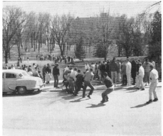
The "Woodchoppers" grunt and groan as they successfully strain to overcome the "C.E.'s" in the traditional tug-o-war across Lake LaVerne. A mighty effort by our brawny heavy-weights won back the coveted broad axe trophy from the civil engineers, our campus rivals.