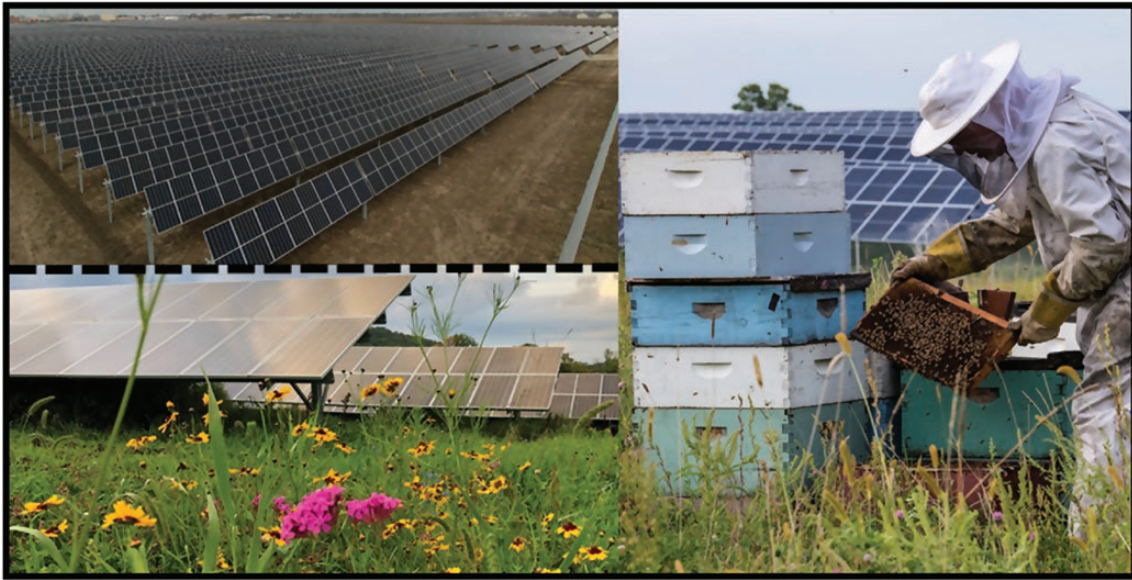
Fig. 1. Top left: a conventional solar farm with gravel substrate (Anon 2020). Bottom: mature pollinator-friendly solar farm. Top: solar farm with a honey bee apiary.

2019). Expanding the definition of agrivoltinics to include beekeeping would add a form of agriculture that produces a product (honey) that reveals the quantifiable benefits of the flowering plants. While some small solar establishments may not provide sufficient flowering resources to significantly affect honey production, others are seeing implementation at a very large scale. For example, the Aurora Solar farm in Minnesota spans over 1000 acres (Swinterton Renewable Energy 2021), and 15 developments of at least this size are currently planned or in progress in Indiana (Weaver 2021). In addition to increased honey production, diverse sources of pollen have been shown to improve the response of honey bees to pathogens (DiPasquale et al. 2013, Dolezal et al. 2019), and could help reduce colony losses and thus improve profitability and sustainability.