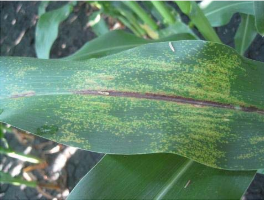
Figure 1. Symptoms of Physoderma brown spot are very characteristic.

Dark purplish to black oval spots also occur on the midrib of the leaf, and may also occur on the stalk, leaf sheath and husks. Symptoms may be confused with eyespot, southern rust or purple leaf sheath, so look for the purplish oval spots. These purplish oval spots are filled with thousands of sporangia (Fig. 2).