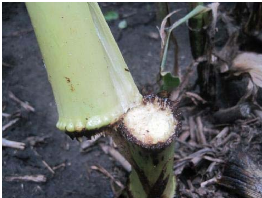
Figure 3. Infected nodes are rotted and snap easily when gently pushed.

Infection of nodes 6 and 7 may result in stalk rot. Physoderma stalk rot has been reported in Iowa for the past three years, predominantly in northern Iowa but there have been reports from SW Iowa in 2013 and just this week the disease was reported in Lee County, SE Iowa. Infected nodes are rotted and snap easily when gently pushed (Fig. 3), for example while walking across rows. Brown spot symptoms often are not visible on the leaves of plants affected with stalk rot. In fact, affected plants often look very healthy and have excellent yield potential.