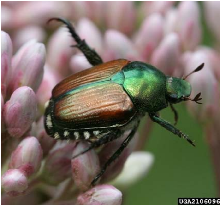
Photo 1. Japanese beetle.

Adults prefer to feed between soybean leaf veins, but can ultimately consume most of the leaf (Photo 2). The treatment threshold for Japanese beetles in soybean is 30 percent defoliation before bloom and 20 percent defoliation after bloom. Most people tend to overestimate plant defoliation, but this reference can help with more accurate estimations. In corn, Japanese beetles can feed on leaves, but the most significant damage comes from clipping silks during pollination (Photo 3). Consider a foliar insecticide during tasseling and silking if there are three or more beetles per ear, silks have been clipped to less than one-half inch AND pollination is less than 50 percent complete.