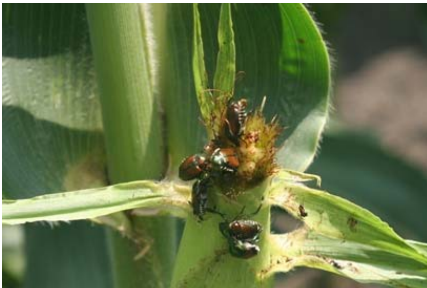
Photo 3. Japanese beetles are strongly attracted to silking corn.