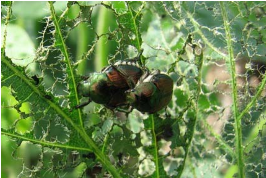
Photo 2. Japanese beetles skeletonize soybean leaves.