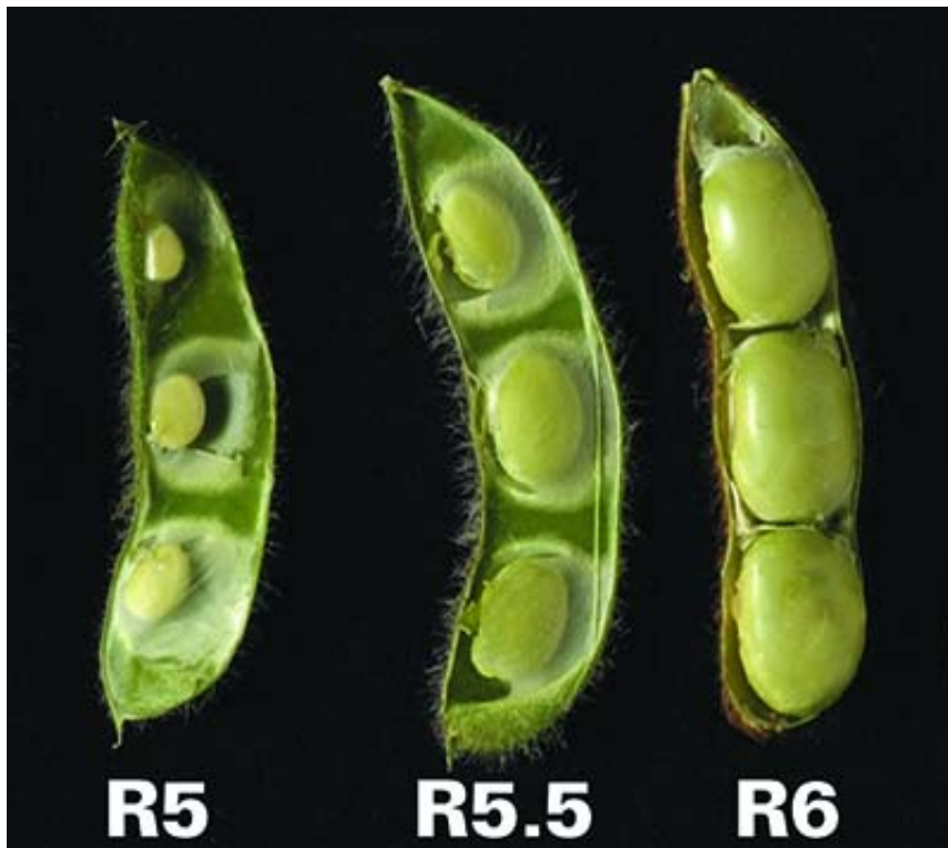
Photo 2. Mid-seed set (R5.5) have seeds that are expanding in the pod.

Spraying at full seed set (R6) or later has not produced a consistent yield benefit in Iowa. In 2013, soybean aphid populations did not peak until late August and a yield response was not consistent in our efficacy evaluation (Fig. 2). Regardless of application timing, leave untreated check strips to assess if the treatment decision was profitable.