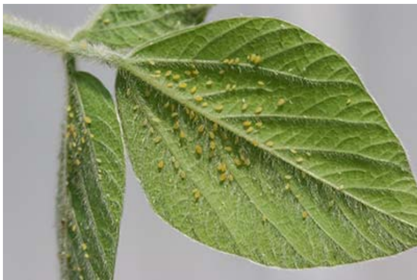
Photo 1. Turn over soybean leaves to estimate soybean aphid density.

fields. Long and short distance immigration is more likely after bloom. Aphids prefer to feed on the undersides of leaves (Photo 1) and will colonize on the newest leaves. If a large colony develops and leaves are crowded, soybean aphid will feed on stems.