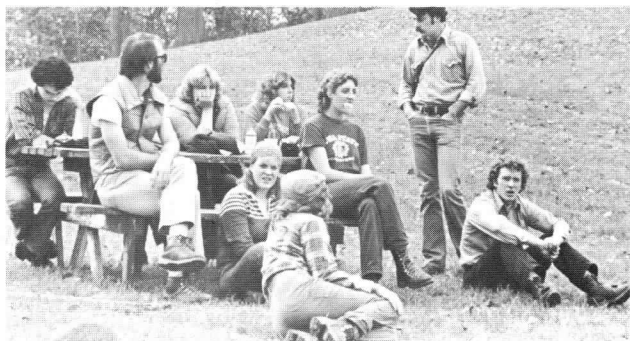
ISU foresters takin' a break.

During the fall of 1982, the 31st Annual Midwestern foresters' Conclave will be hosted by ISU at the 4-H Camp. Everyone is encouraged to attend and all ISU Forestry students should plan to compete. All former conclave members will testify it's a good time to meet other students in their profession.