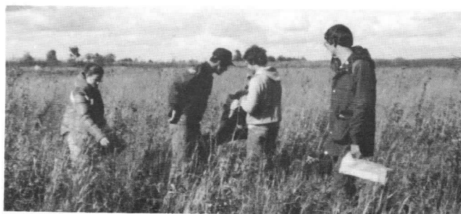
Xi Sigma Pi service day.