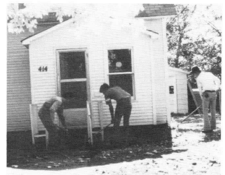
Xi Sigma Pi Work Day