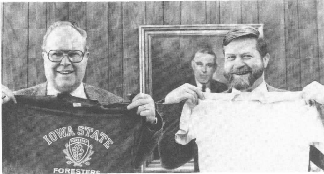
Honorary Iowa State Foresters.

A lot of preparation went into this workshop and openhouse. A visit from the Chief is something that doesn't happen very often to a Forestry Department, so this will be remembered by many of us for some time to come.