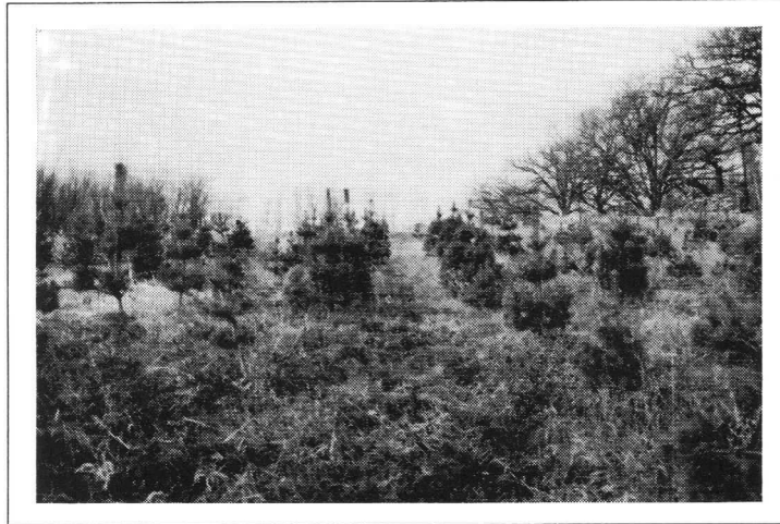
The Christmas tree plantation