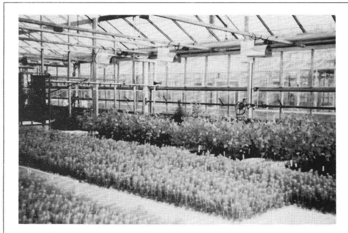
Seedlings for distribution during Earth Week and Veishea